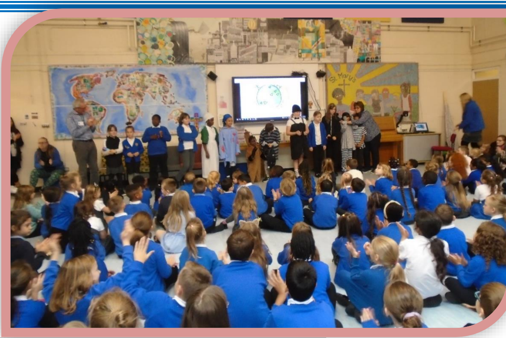
Our Worship Warrior's leading the whole school worship