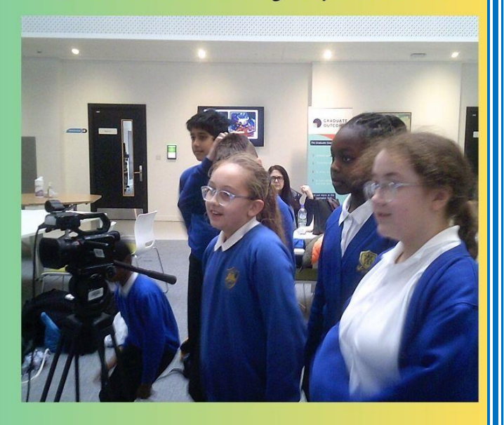
KingDavid- "I liked the Detective workshop-investigating clues".