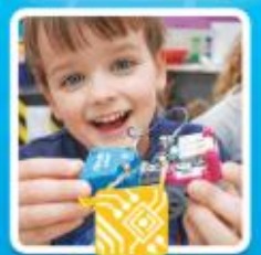
Circuitry & Electronics