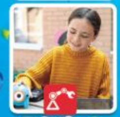
Robotics & Coding